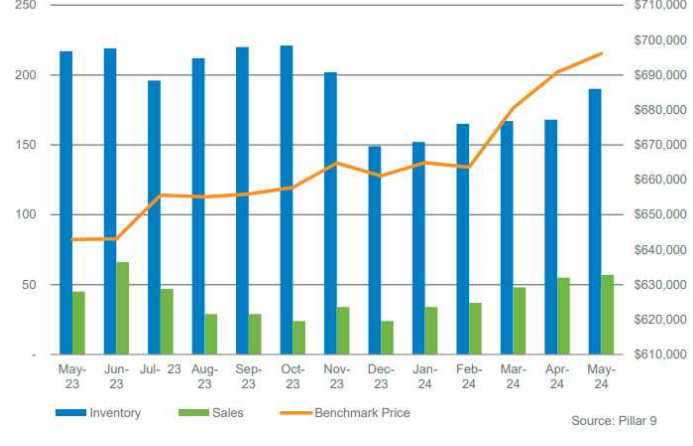
INVENTORY, SALES, AND PRICE

For detailed statistics in your area: https://www.creb.com/Housing_Statistics/